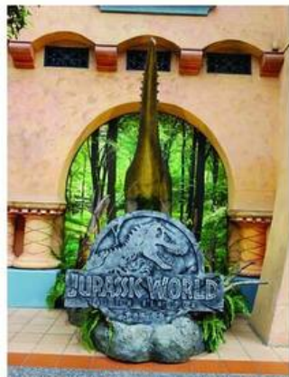
MOVING AND ROARING Stegosaurus .

Pteranodons (flying reptiles with kite-like bodies and long beaks), a life-sized Velociraptor (the deadly, smart and long-tailed dinosaur prominent in the Jurassic films) and a giant T. rex terrify the unsuspecting crowd.