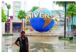
IN FRONT of the world's first and only Universal Studios Globe with Singapore marked on the map.