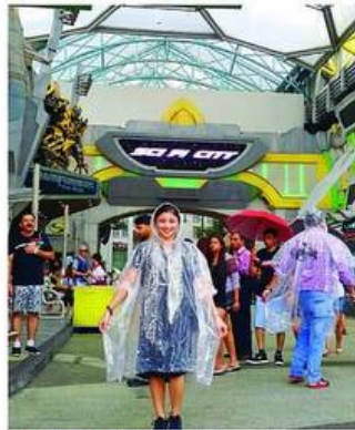
MY FAVORITE PICTURE at Universal Studios Singapore, wearing a packable poncho like some of the people behind me. My poncho kept me dry from the heavy rains and unpredictable splashes at Jurassic Park Rapids Adventure .