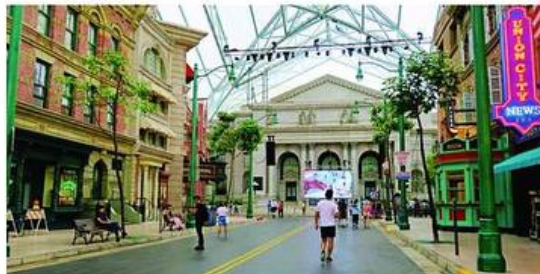
STROLL ALONG THE sidewalks of bold and romantic Big Apple, a few meters away from Jurassic Encounter .