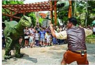
ONE-OF-A-KIND experience training the smart and feisty Velociraptor at Raptor Training School.