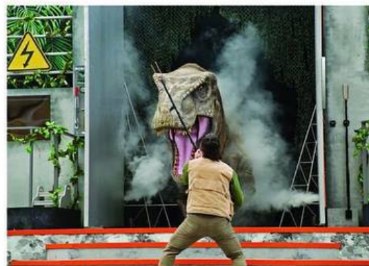
THE MIGHTY T. REX at Jurassic World: Roar! A 15-minute live-action show on the Hollywood Lagoon Stage.

This live-action show starts with an introduction to two Jurassic World team members: Miles, who is the head of security, and Elizabeth, the park director. Within minutes, things go haywire as violent dinosaurs escape the surrounding portable containment units. A dozen